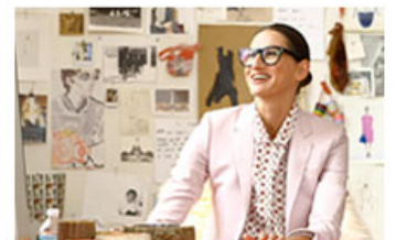
What Successful Women Look for in the Young Women They Hire