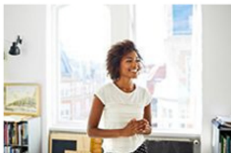
How to Highlight Your Accomplishments and Why It Matters