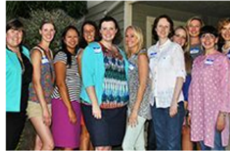
Join a Lean In Circle to Meet Mentors and Chat With Other Young Women