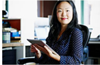
Defy Gender Barriers: How to Negotiate Your Salary With Confidence